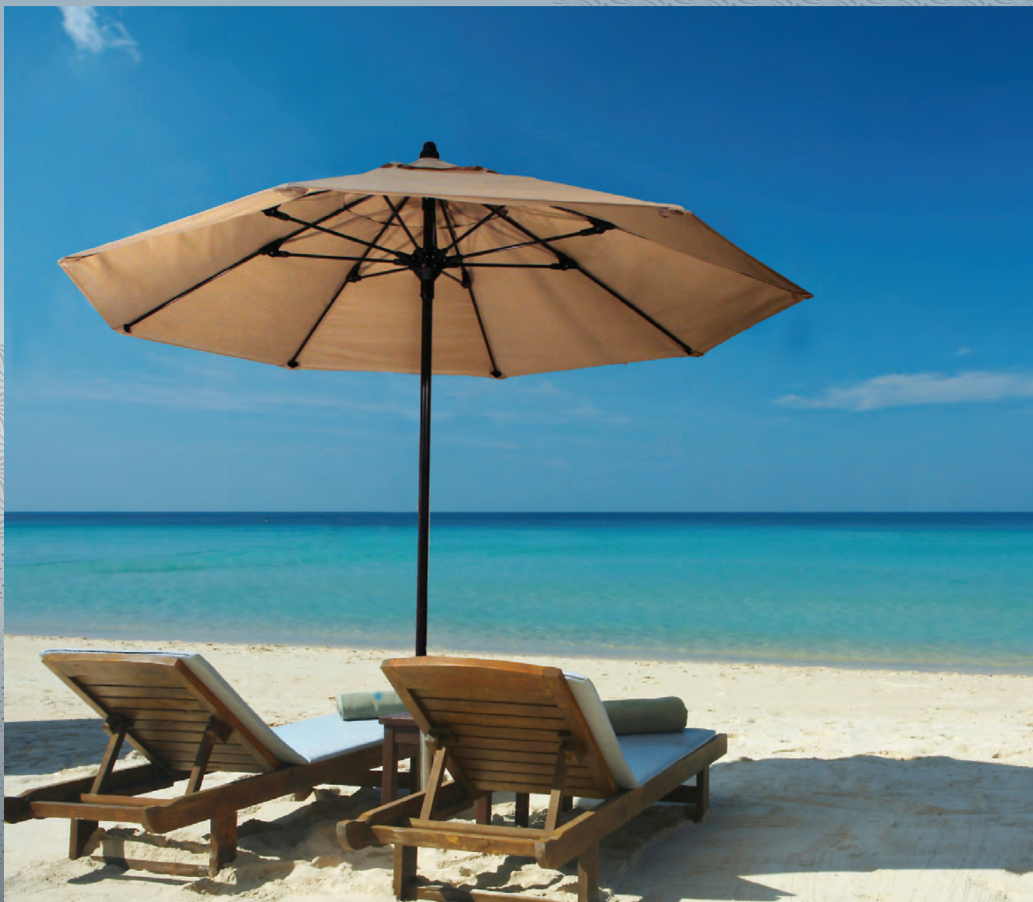
THE REEF UMBRELLA