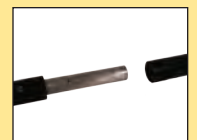
2 PIECE POLE CODE: 2P