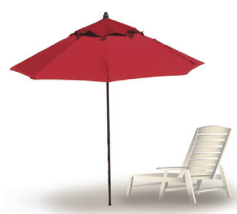
Jockey Red 4603