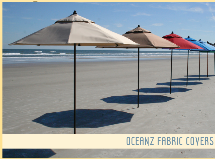
OCEANZ FABRIC COVERS