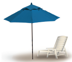
Pacific Blue 4601