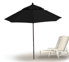
Jet Black 4608

* Colors on these images may vary from actual product. Please verify colors using actual Sunbrella® fabric samples available at most retailers.