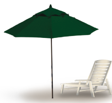
Forest Green 4637